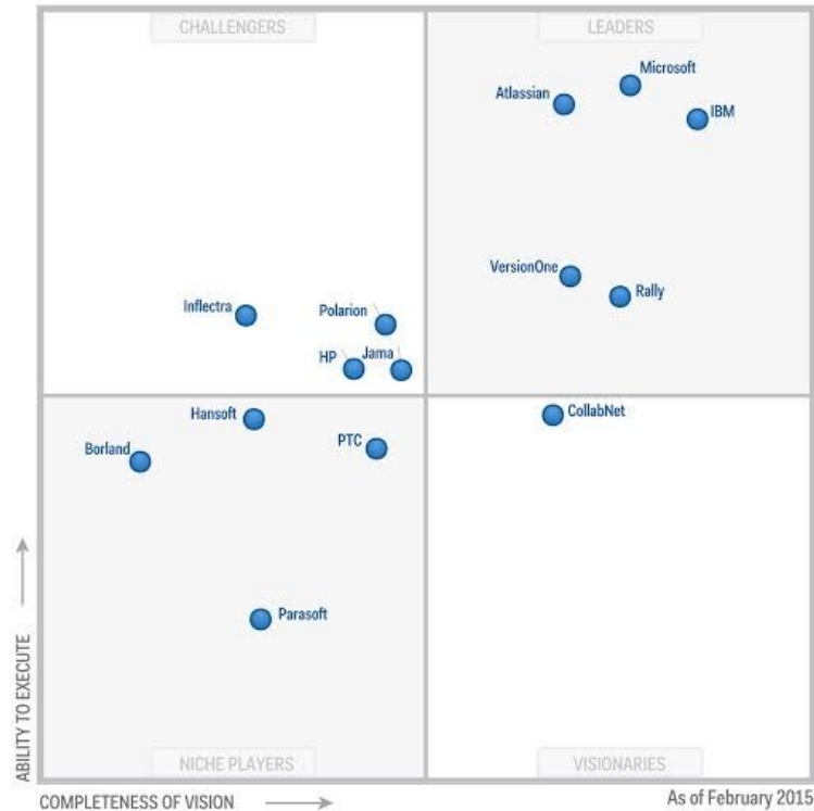
Figure 1. Magic Quadrant for Application Development Life Cycle Management